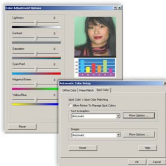
Advanced colour tools allow you to fine-tune output to your specifications.