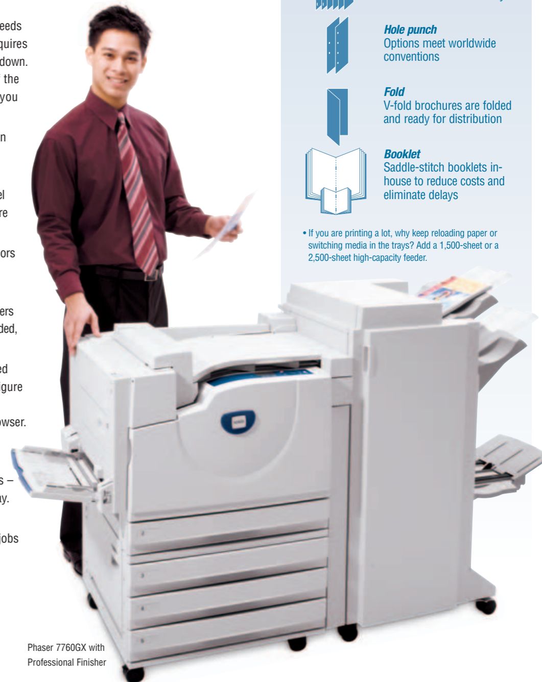
Phaser 7760GX with Professional Finisher