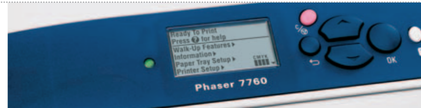
Large, six-line control panel gives quick access to all print functions and provides help solutions if needed.