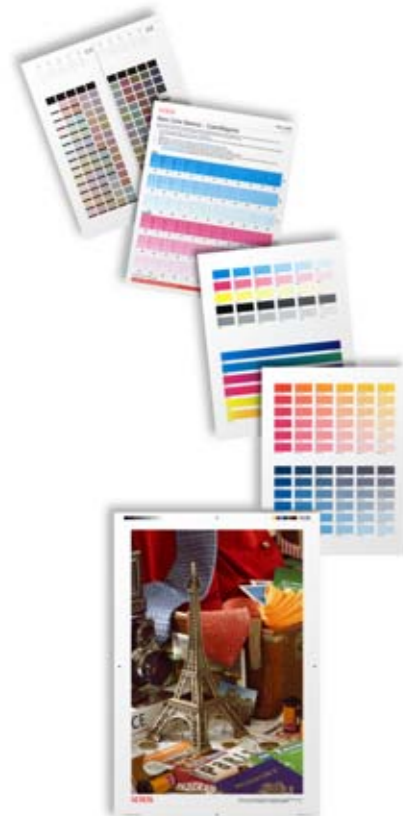
Built in colour calibration tools give you the final output you want.

High-quality, consistent colour is crucial when relying on stunning visuals to convey your ideas and concepts. That's why the Fuji Xerox Phaser 7760 colour printer is the designer's choice. It offers brilliant colour, blazing speeds and easy-to-use features that make the most of everything you print.