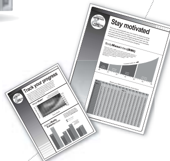
Crisp, A3 black & white printing, up to 1200 dpi