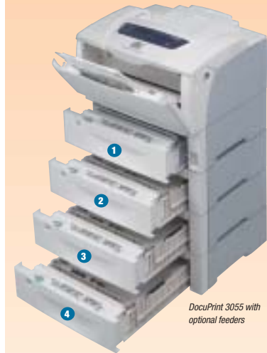
DocuPrint 3055 with optional feeders