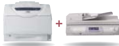
Combine the DocuScan C4250 scanner with either DocuPrint 2065 or DocuPrint 3055 printer for feature-rich copying and scanning capabilities.